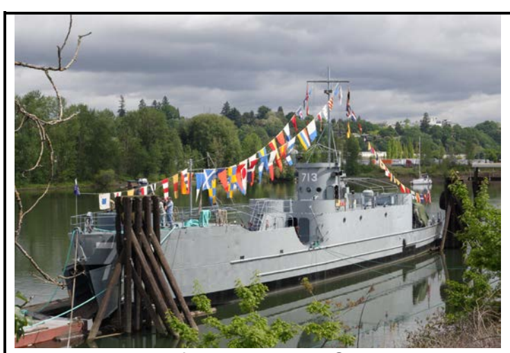
And, of course, the LCI-713! <u>www.lci713.com</u> <u>www.facebook.com/lci713</u>