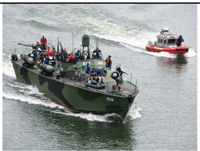
The PT Boat too! www.savetheptboatinc.com