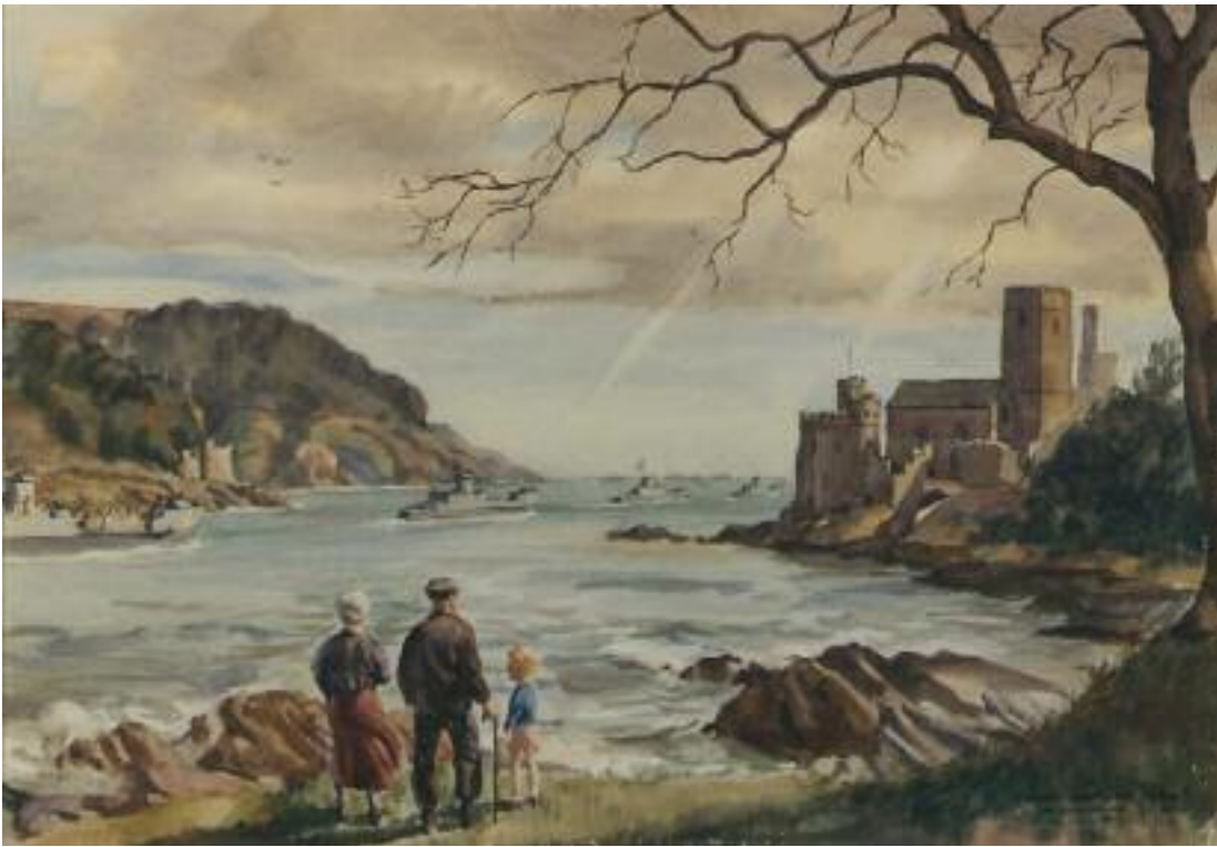
"Leaving Harbor" LCIs depart from Dartmouth en route to Normandy.