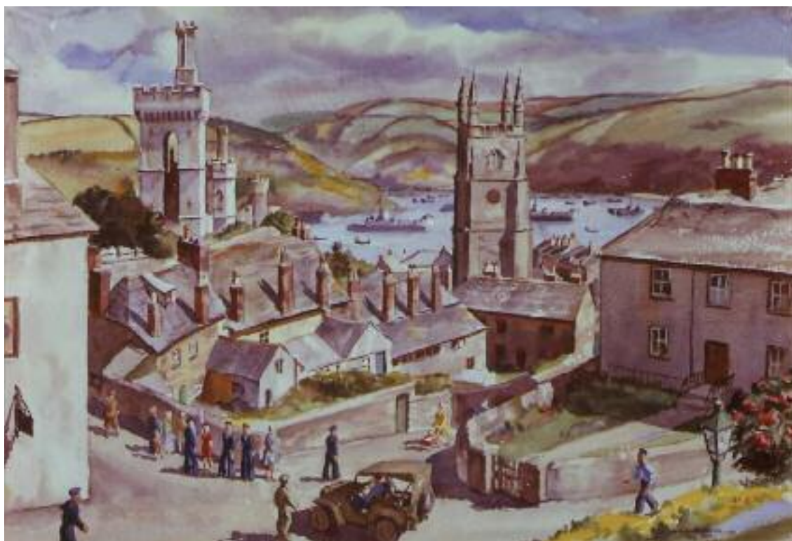
"Fowey, England" U.S. Sailors visit this small port in Cornwall. Note LCIs in the harbor.