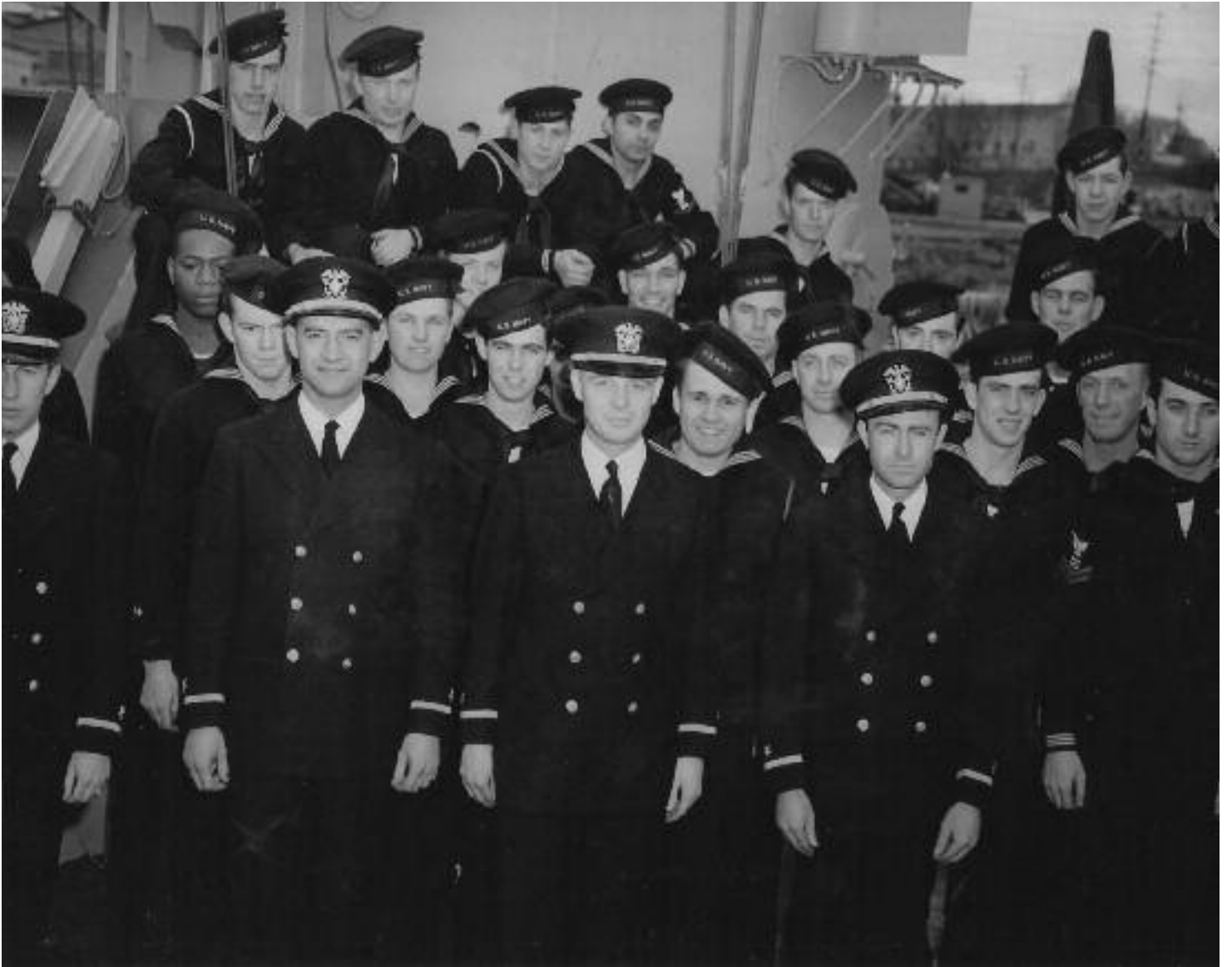
"The Squared-Away Crew of the 1017"