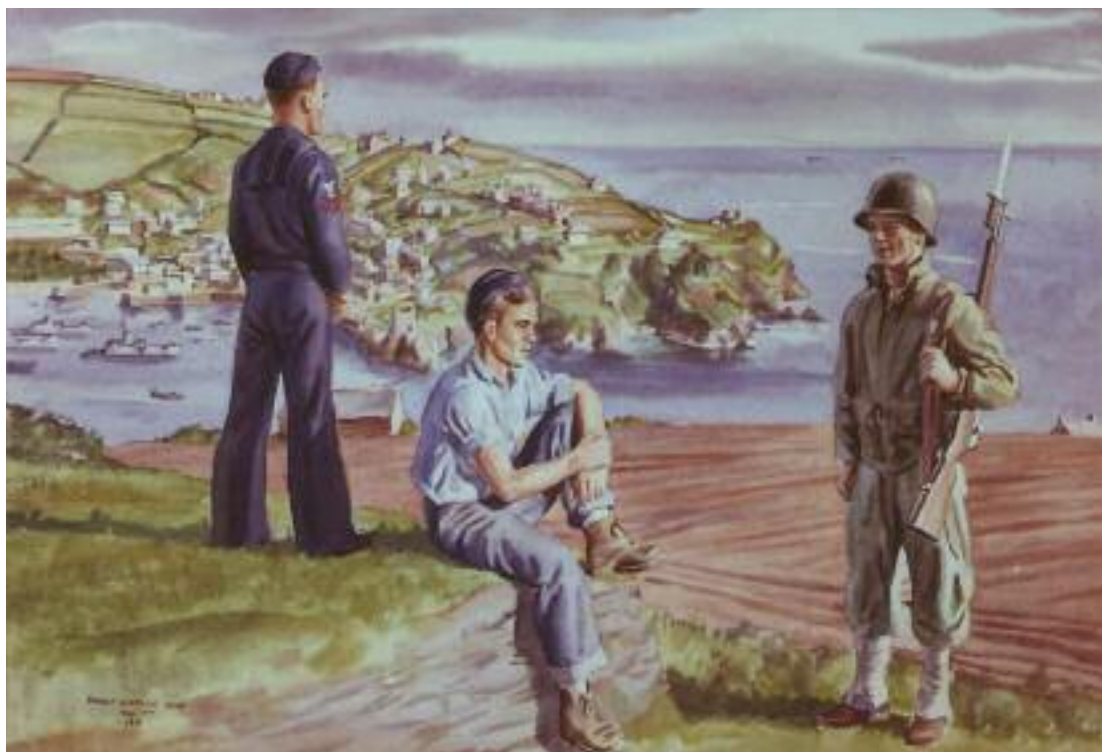
"When is D-Day?" – Overlooking the entrance to Dartmouth Harbor. Note LCIs at anchor.