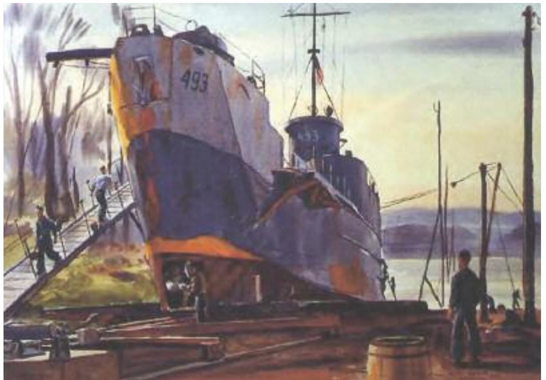
"The Wounded Amphibian" Dartmouth, England, spring, 1944. LCI (L) 493 undergoes repairs after damage in practice landing.